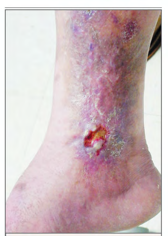
Figure 1. Classic Appearance of a Venous Stasis Ulcer. A venous stasis ulcer is usually located above the medial malleolus and has an indolent appearance, with granulation tissue at its base that does not appear to be ischemic. Scarring of variable extent usually surrounds chronic and recurrent ulcers. Hyperpigmentation, lipodermatosclerosis (induration involving skin and subcutaneous fat), and stasis dermatitis are variably present in the lower third of the leg (the "gaiter" area). Pedal pulses are usually palpable. If they are not palpable because of induration or swelling, ankle pressures measured by means of Doppler ultrasonography will be normal in the absence of associated ischemic disease.

sons, including application difficulty (because of frailty or arthritis), physical constraints (e.g., limb obesity, contact dermatitis, or tender, fragile, or weepy skin), and coexisting arterial insufficiency. In a large community clinic, nearly 50% of patients were not able to use stockings for these reasons.<sup>30</sup> Many patients who can wear stockings abandon them after initial use for a variety of stated reasons, such as tightness and warmth.<sup>31</sup> Reported rates of noncompliance have ranged from 30 to 65%, even under clinical supervision in venous-ulcer clinics.<sup>32-34</sup>