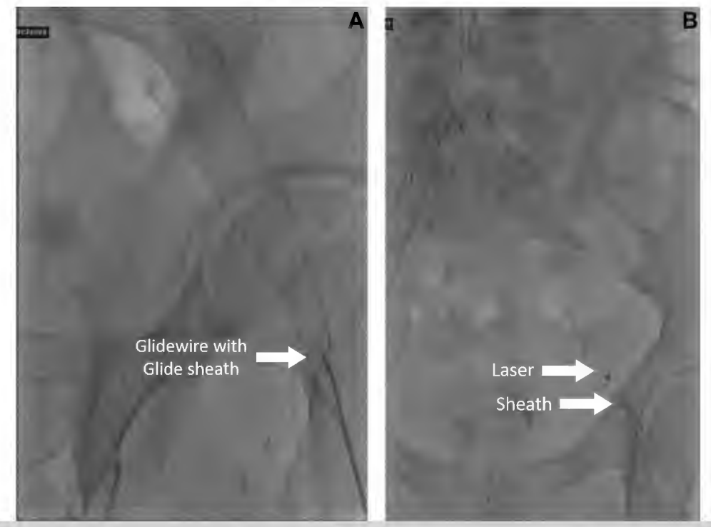
Fig 2. A, A Glidewire with a Glide catheter used to engage the terminal portion of the chronically occluded stent in the common femoral vein segment. B , Laser supported by a sheath was used to recanalize the stent, followed by angioplasty.

Fig 1. A , Anteroposterior projection venogram demonstrating stent occlusion. The stent could not be traversed with the Glidewire alone. Collateral veins can also be seen. B , Intravascular ultrasound image demonstrating occlusion of the stent in the common femoral venous segment.