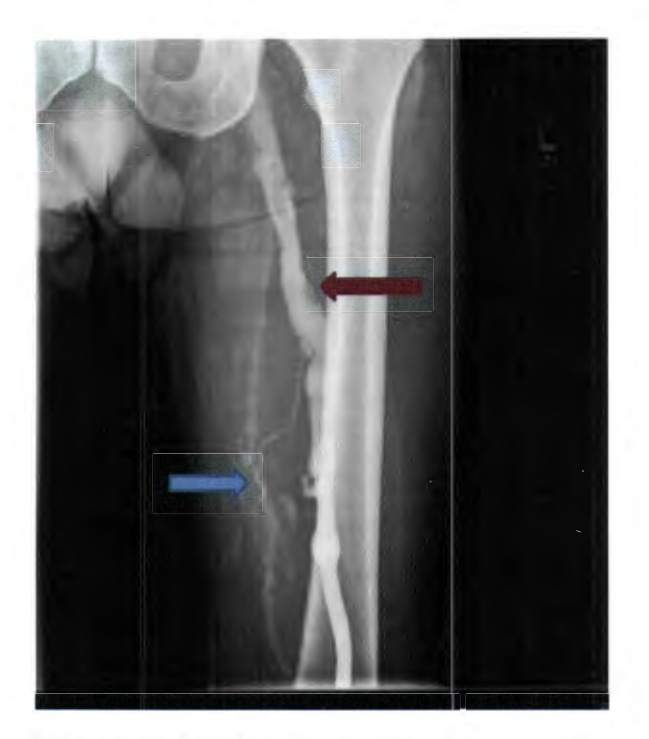
Fig 3. Chronic femoral vein occlusion ( left arrow ) with excellent collateralization through profunda femoris vein ( right arrow ). The enlarged profunda femoris vein can be easily mistaken for the femoral vein because of comparable lumen size and anatomic course.

and 25 months, respectively), of which one was reopened by lysis. Median iliac vein stenosis was 80% (40%-100%). These IVUS planimetry data include four limbs in which the lesion was only partially visible with area values of <50% stenosis.