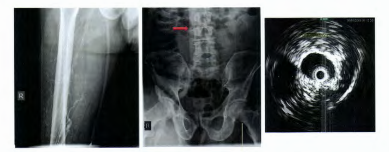
Fig 2. A 60-year-old man with post-thrombotic occlusion of the right femoral vein ( left ) and a "normal"-appearing iliac vein on venography ( middle ). A Greenfield filter can be seen in the vena cava ( arrow ). On intravascular ultrasound (IVUS) examination ( right ), there was no stenosis at the filter site, but a long diffuse stenosis was present in the common iliac vein. The lumen area measures 78.5 mm<sup>2</sup> (61% stenosis) compared with a normal expected lumen area of 200 mm<sup>2</sup>.

There was no procedural mortality (30 days). Morbidity included recurrent deep venous thrombosis in two limbs (<30 days). Stents occluded in two limbs (at 5