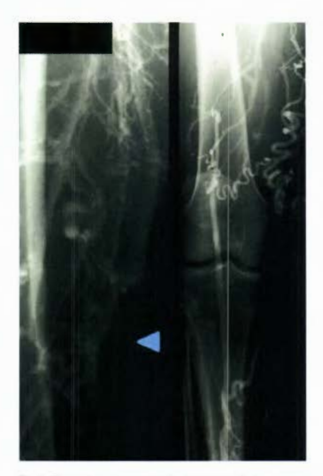
Fig 4. Descending venogram ( left ) shows multiple deep venous collaterals in a limb with occluded femoral vein ( arrowhead ), yet ascending venogram ( right ) opacifies only the superficial venous network, with the deep system seemingly "wiped out." This is due to failure of the contrast material to enter the higher pressure deep venous system in such limbs.

knee, although significant from the patient's point of view, will still be classified as grade 3 by objective grading and will not be adequately reflected in the current classification system. Whereas the current report documents subjective improvement as reported by the patient in these cases, it remains subject to the vagaries of the placebo effect. A classification with better resolution of swelling severity is needed. Gross swelling extending to the thigh deserves a higher grade in the classification system than one confined to below the knee. Plethysmographic techniques, which are notoriously cumbersome, are virtually impossible when swelling extends to the thigh.