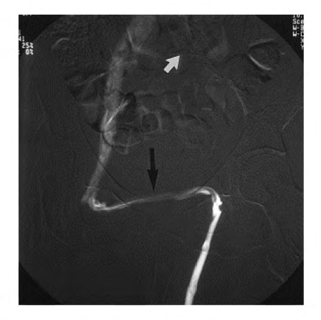
Fig 1. Venograms showing patent left to right cross-femoral saphenous vein graft 6 months after Palma procedure. From Jost CJ, Gloviczki P, Cherry KJ, McKusick MA, Harmsen WS, Jenkins GD, Bower TC. Surgical reconstructions of iliofemoral veins and the inferior vena cava for nonmalignant occlusive disease. J Vasc Surg 2001:33:320-8, with permission.<sup>109</sup>

solution and tunneled to the contralateral groin in a suprapubic, subcutaneous position, where it is anastomosed to the common femoral vein. Excision of intraluminal post-thrombotic fibrous bands following femoral venotomy (endophlebectomy) may be needed. When suitable autologous conduit is not available, an 8 or 10-mm, externally supported expanded polytetrafluoroethylene (ePTFE) graft is the best alternative. A temporary arteriovenous fistula can be placed to improve flow and to aid patency. A large tributary of the ipsilateral great saphenous vein or the transected great saphenous vein can be anastomosed in an end-to-side fashion to the proximal superficial femoral artery. In patients with vein graft, this fistula is taken down at 3 months. In those with ePTFE grafts, the fistula should be left as long as possible in an asymptomatic patient.