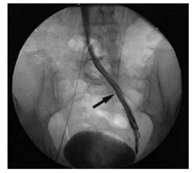
Fig 2. Patent left femorocaval PTFE bypass 11.7 years after surgery. From Jost CJ, Gloviczki P, Cherry KJ, McKusick MA, Harmsen WS, Jenkins GD, Bower TC. Surgical reconstructions of iliofemoral veins and the inferior vena cava for nonmalignant occlusive disease. J Vasc Surg 2001:33:320-8, with permission.<sup>109</sup>

Prosthetic femorocaval or iliocaval bypass. Anatomic in-line iliac or iliocaval reconstruction can be performed for (1) unilateral disease when autologous conduit for a suprapubic graft is not available or (2) bilateral iliac,