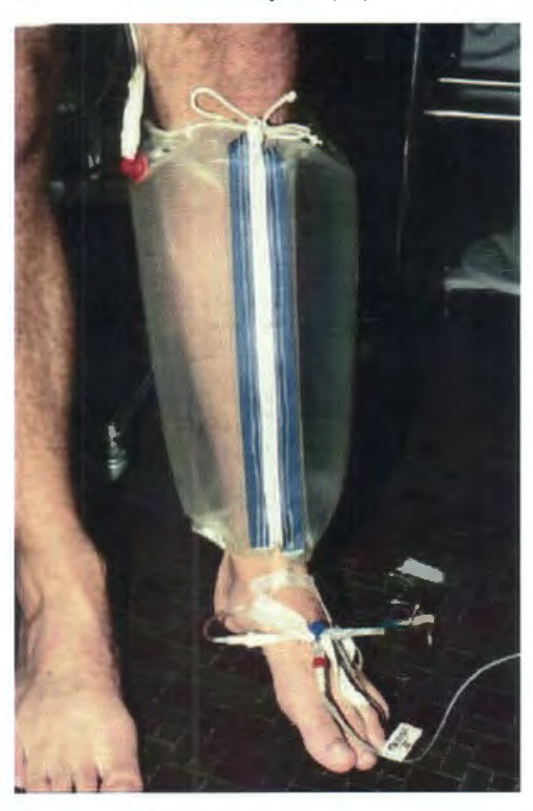
Figure 2 - Air plethysmography and ambulatory venous pressure can be performed at the same time as the tip toe movements for both tests are the same (adapted from Raju et al^4 )

The following parameters were obtained: venous volume (VV), venous filling index (VFI90), ejection volume (EV), ejection fraction (EF), residual volume (RV), RVF and calf volume recovery time (RT).