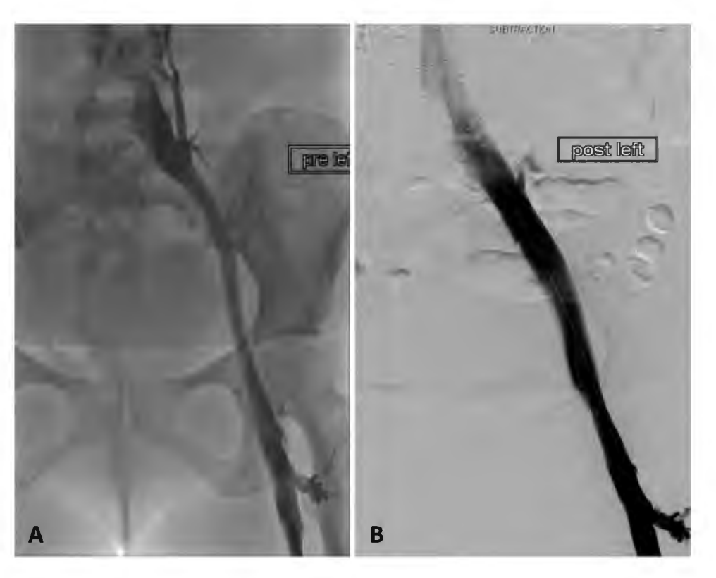
Fig. 1. (. A–B). (A) Pre stenting venogram demonstrating severe stenosis with pancaking at the level of the left common iliac vein – caval confluence with filling of collaterals in addition to long segment iliac vein stenosis caudally. (B) Venogram demonstrating correction of stenotic components post stenting with preferential inline flow.

Wallstent (Boston Scientific, Marlborough, MA) Z stent (Cook Medical, Bloomington, IN) configuration (Fig. 1 A, B) extending from the cranial common femoral vein to the distal inferior vena cava just cranial to the iliac confluence. Post stenting, she had significant improvement of her symptoms with the venous clinical severity score (VCSS) improving from a pre-op score of 9-5 post stenting, the visual analog scale (VAS) pain score improving from 8-0 and the grade of swelling going from 3 (swelling involving the leg up to the knee) to 0 (No swelling). Post intervention she was placed on apixaban 5 mg twice daily, cilostazol 50 mg twice daily, and aspirin 81 mg daily. At the 6-month mark post procedure, the cilostazol was stopped, and around the 9-month mark, the apixaban was dropped to 2.5 mg twice daily. The ASA was continued at the 81 mg dose. She was followed with routine DUS / clinical visits and remained asymptomatic till early 2021 when she developed a recurrence of disabling symptoms including, pain, swelling, heaviness, tiredness of the left leg with impairment of her quality of life over a 4-week period. DUS performed revealed a trickle flow channel in the external iliac vein with ISR in the remainder of the stent ranging from 38%–53%