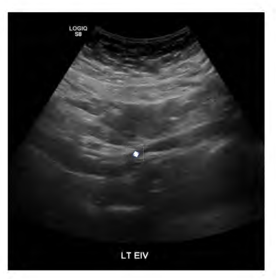
Fig. 2. Duplex ultrasound B mode transverse image of the left external iliac venous stent segment demonstrating severe instent restenosis with calcification (near occlusion). The white arrow depicts the remaining trickle flow channel.

and Company, Franklin Lakes, NJ) inflated to burst pressure (16 mm Hg) to help build on the work done by the thrombectomy device. Post angioplasty, we did one more pass with the device to see if we could further debulk the residual ISR. This was followed by stent extension (18 \times 80 \text{ mm Venovo}) stent [Becton, Dickinson, and Company, Franklin Lakes, NJ]) into the widely patent common femoral venous segment to provide good inflow into the stent. Post dilation was then carried out using a 20 \times 40 mm Atlas Gold angioplasty balloon inflated to burst pressure (16 mm Hg) to optimize the flow channel across the entire stent column at the same time deal with the minimal residual ISR and was successful on both counts. This was followed by completion IVUS (Fig. 5) and completion venogram, which demonstrated good results. She tolerated the procedure well and was discharged home the following day after the post procedure DUS demonstrated a widely patent iliofemoral stent column. Post intervention she was maintained on apixaban 5 mg BID and ASA 81, with plans to continue both lifelong. At one month follow up she