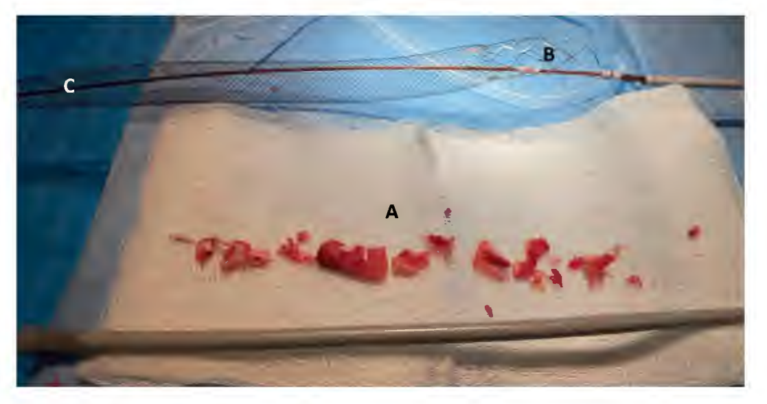
Fig. 4. (. A–C) Chronic calcified thrombus (A) excised using the Inari ClotTriever Thrombectomy System with the coring element (B) and the collection bag (C) in the background.

Fig. 3. (. A–B) Initial IVUS interrogation of the left iliac vein stent. (A) demonstrates severe ISR with an internal ring of concentric calcification and barely a luminal channel. (B) moderate ISR in the common iliac venous stent segment.