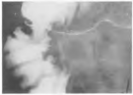
FIG. 2. Ancylostomal duodenitis.

12 it was possible to repeat the augmented histamine test after a period of over four weeks following a satisfactory antihelmintic course of treatment (Table VIII). The basal acid output seemed to drop, but this was not proved statistically significant. The study, however, has to be extended to a larger number and the acid secretion study repeated after a longer period subsequent to de-infestation, taking due care to eliminate the possibility of re-infestation.